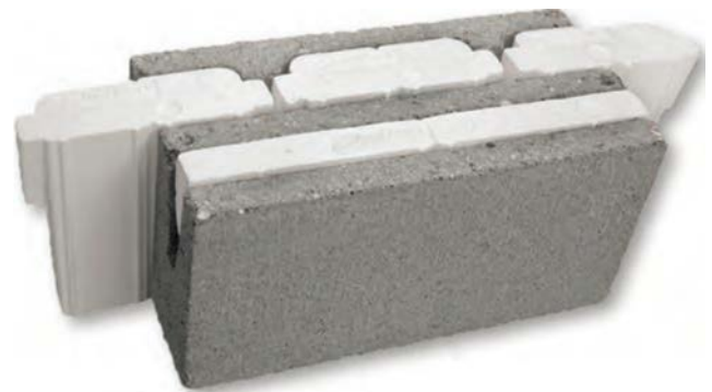
Three layers of masonry Two layers of EPS foam inserts

Residential Homes: Single-family houses (from basements to the highest wall), condominiums, and townhouses (including partition walls).