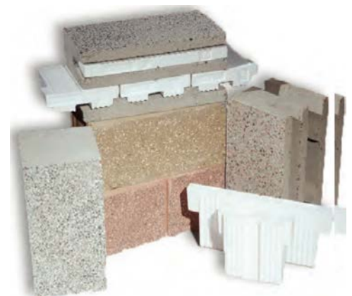
Block finish options