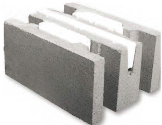
Four layers of masonry Three layers of EPS foam inserts